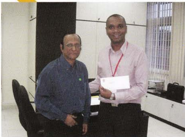
Coral Secondary School