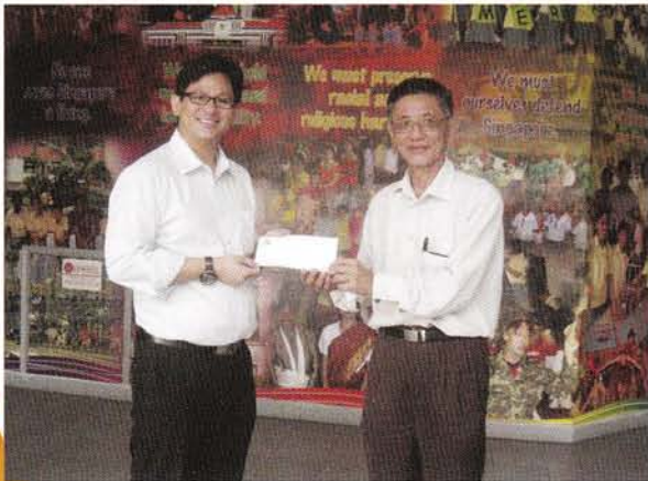
Siglap Secondary School

The following schools received the grant: Siglap Secondary School, Coral Secondary School, Canossa Convent Primary School, Cedar Primary School, Da Qiao Primary School, Ang Mo Kio Primary School, Yishun Secondary School, Teck Whye Secondary School, Greenridge Primary School and Queensway Secondary School