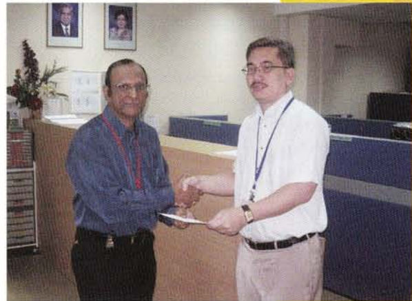
Da Qiao Primary School