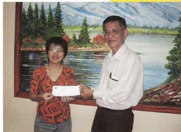
Greenridge Primary School