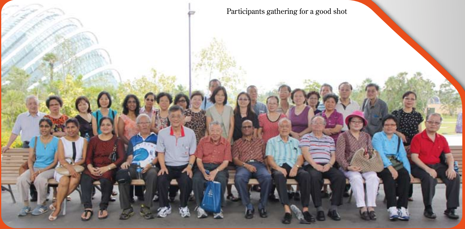
Participants gathering for a good shot

It was indeed a fruitful and enjoyable trip. The participants also had a great time bonding with each other at lunch after the trip.