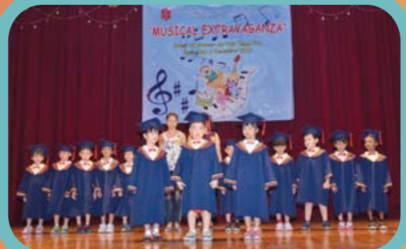
The K2 Graduand