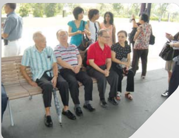
Waiting for instruction