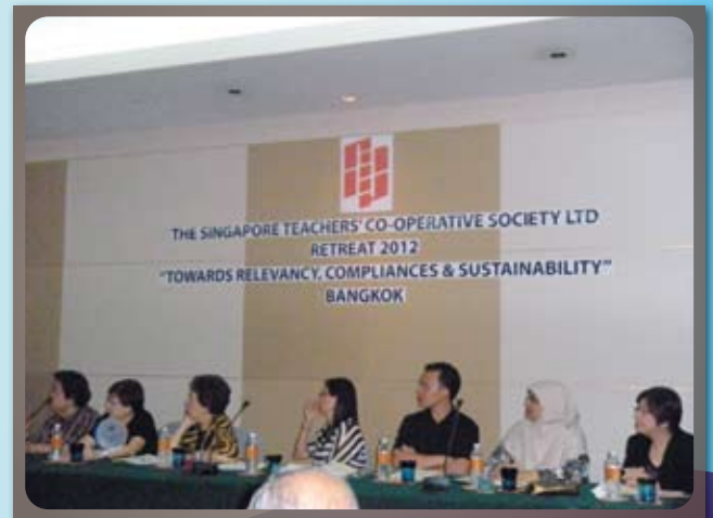
Participants listening attentively