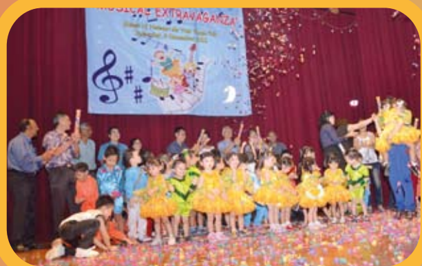
The Grand Finale