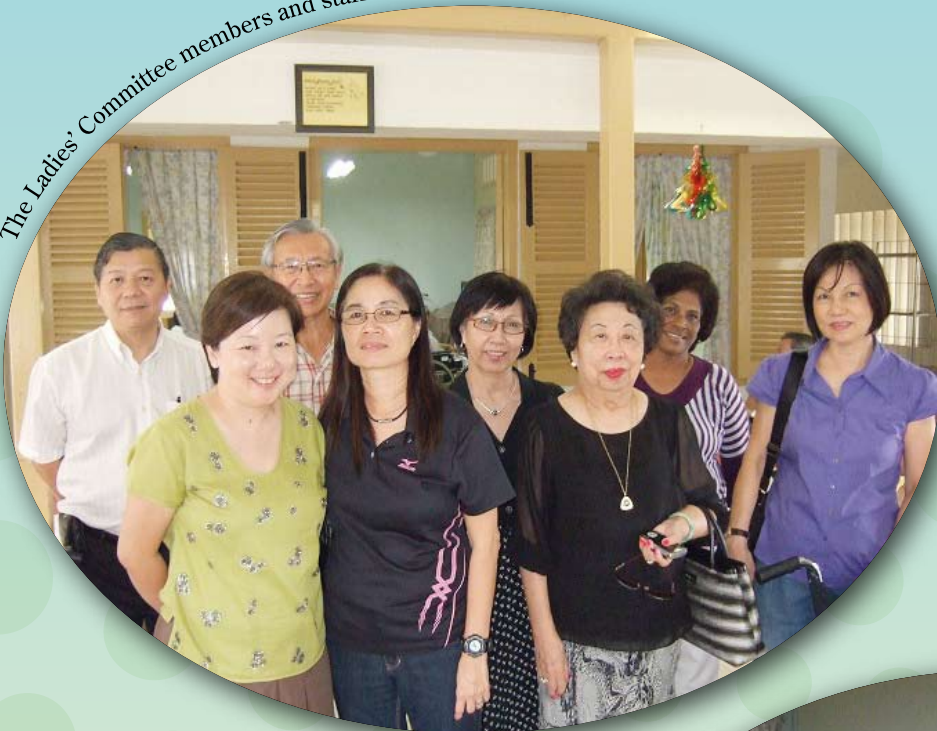
The Ladies' Committee members and staff of the Home