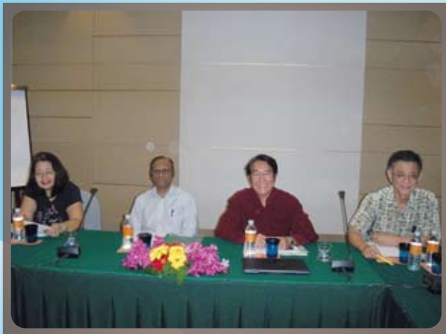
From Left, 1st Vice President, Chairman, 2nd Vice President and Senior Manager