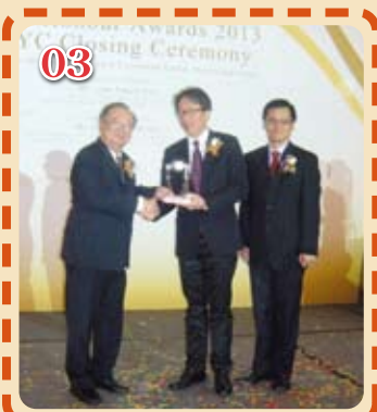
SNCF Honour Award Ceremony 2013

The Society's 77th Annual General Meeting will be held on Saturday, 25 May 2013, at 1000 Hours, at the Parkroyal on Kitchener Road, 181 Kitchener Road, Singapore 208533. All ordinary members are cordially invited to attend this important function of the Society. Tickets for the lunch after the meeting will be on sale from 22 April 2013. As the seating capacity is limited, members are advised to purchase the tickets for lunch ($10 each) early personally at the Society. No reservation by phone would be accepted.