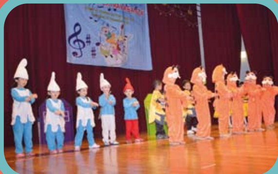
The lovely performers