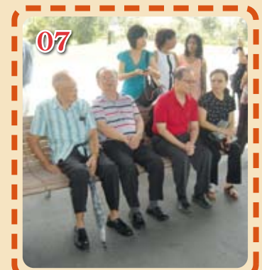
Tour to Gardens By The Bay