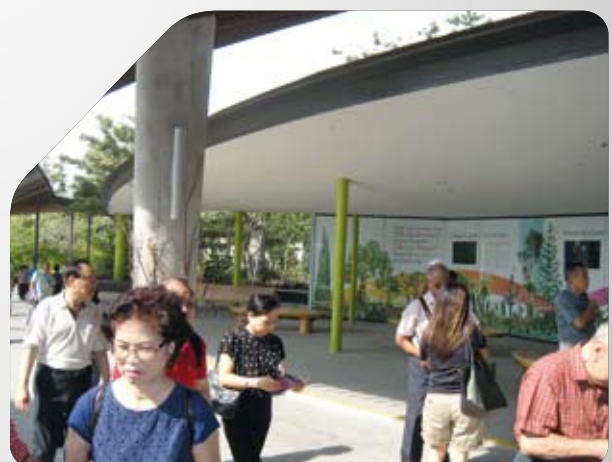
Free and Easy