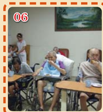
Visit St Theresa's Home for the Aged