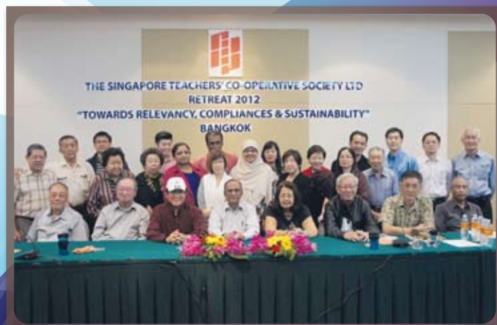
The Retreat's Participants