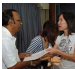
2nd winner leader