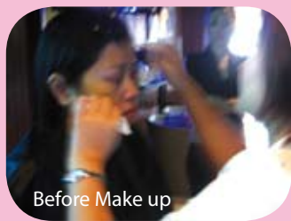
Before Make up

Live demonstrations included, the proper use of make-up tools and essential preparations on skin care.