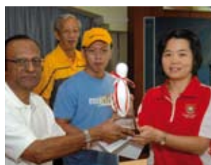
3rd winner leader

The champion school was Evergreen Primary School. The second placing went to Pioneer Secondary School while Yishun Junior College came in third.