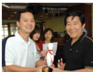
1st winner leader

It was heartening to see many members bringing in their family to join in the fun. Cash prizes of $1000, $800, $500 were awarded to the top three teams respectively.