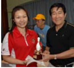
Best Female Bowler