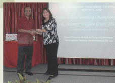
Balestier Secondary School