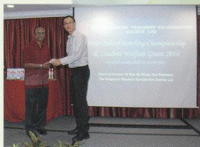
Anderson Secondary School