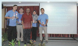
1st Runner-up St Hilda's Primary School