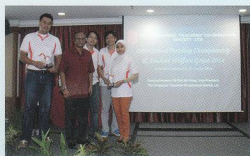
2nd Runner-up Compassvale Primary School