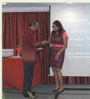
Boon Lay Garden Primary School