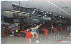
Take aim and release!