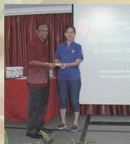
Coral Primary School