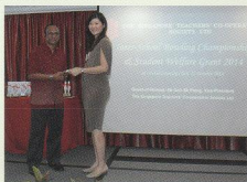
Guangyang Secondary School