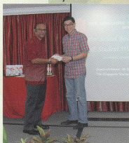
Canberra Primary School