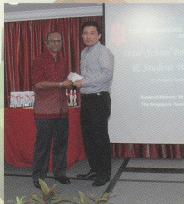
Hong Wen School