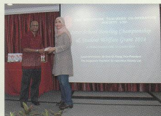
MacPhenson Secondary School