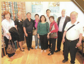
Delegates from Singapore

The Co-operatives in Singapore are in a transitional state. While we grow, we need to listen to the members' needs. We must also ensure that the Co-operative is constantly evolving.