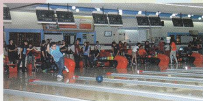
Here goes the ball!