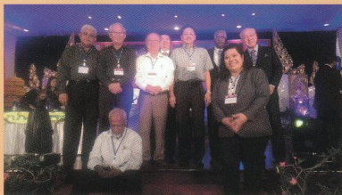
The coming together of delegates from Singapore and Asean countries

The forum endorsed that for Co-operatives to operate successfully, it is important that the right candidates be selected to sit on the Board of Directors/Committee of Management and these personnel should be assessed yearly.