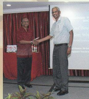
Punggol View Primary School