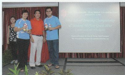
Champion South View Primary School