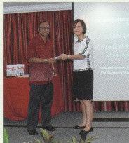
Guangyang Primary School